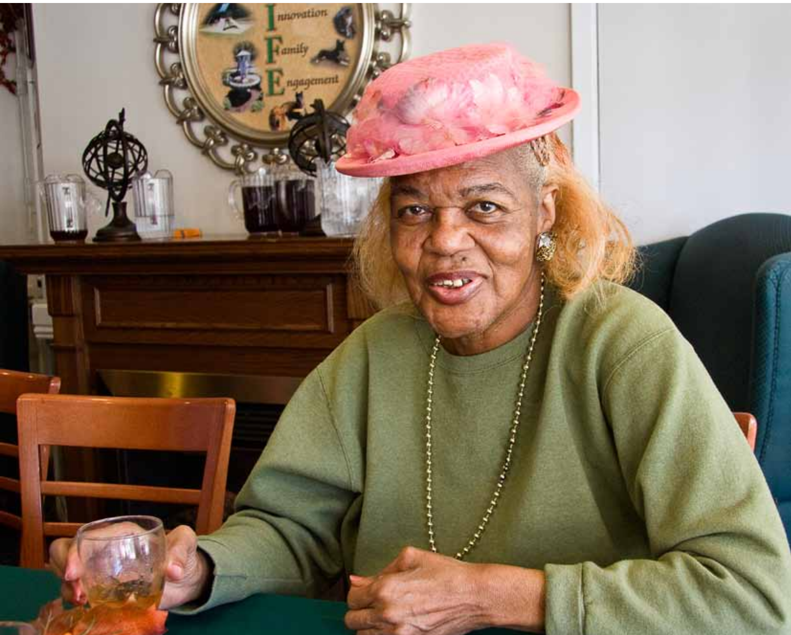
Six women at this Silverado Senior Living residential Alzheimer's community in Texas, USA, were taken by staff members to a flea market to select and purchase a hat. The next day a special table was set for them in the dining room. Each woman arrived, sporting her new hat or was helped to put it on. They all had a good time.

The effectiveness of health systems in identifying people with dementia depends upon the potential consumers, as well as the providers of health and social care. Encouraging help-seeking by raising awareness of dementia is an essential component of any comprehensive strategy to close the treatment gap. However, increased demand needs to be met by adequately prepared and resourced services, trained and able to make accurate diagnoses in a timely and efficient manner, and to ensure that the diagnosis leads seamlessly to the provision of evidence-based care. While acknowledging the importance of promoting demand for services, the focus for this chapter is upon service responses.